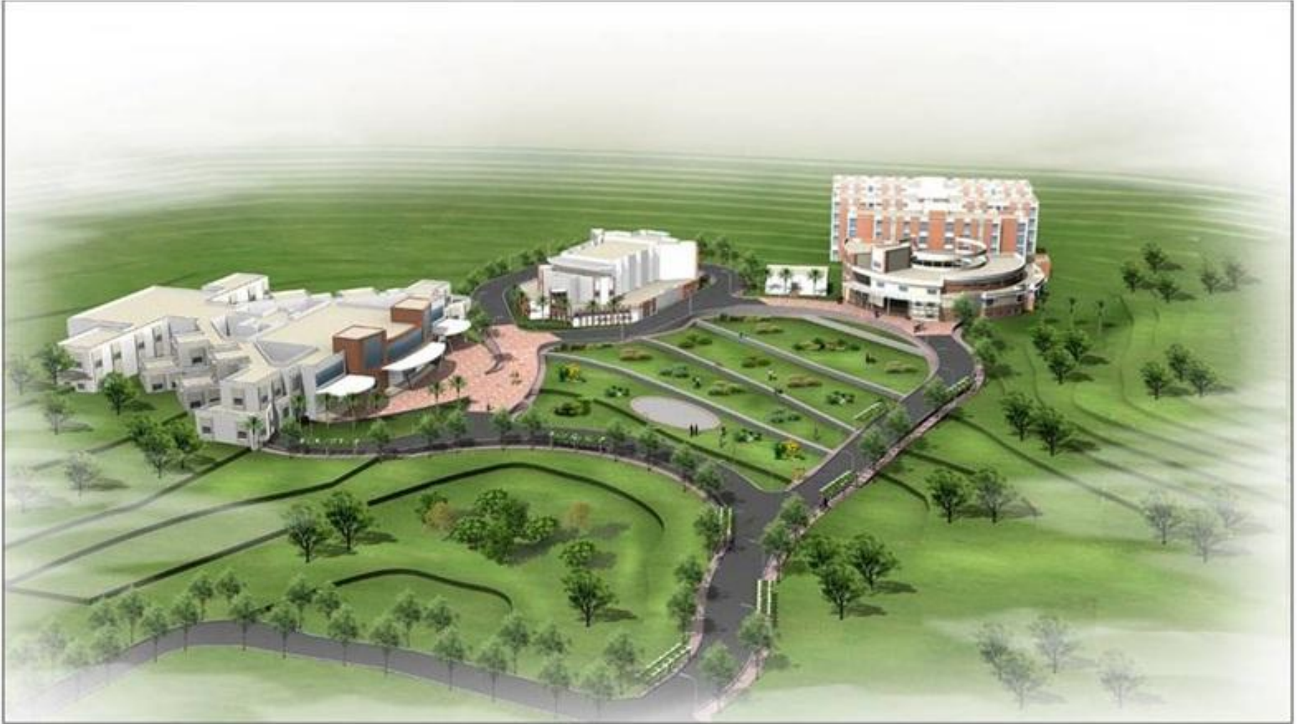
Proposed MBA Complex; Academic Block, Auditorium and Hostel