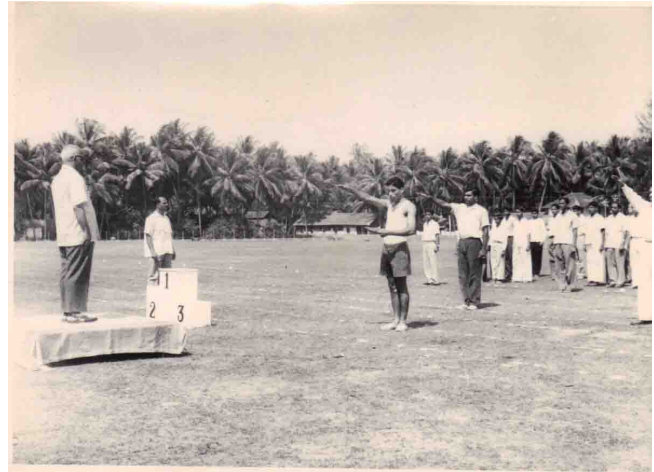
A Sports Day

grossed in cheering up our team, one of our indomitable mates who stranded in the hostile territory in search of water was surreptitiously made captive and we freed him in a commando style rear guard action without any commotion. Realizing the catastrophic outcomes of such skirmishes, we gradually struck up friendship with a ginger group among the op-