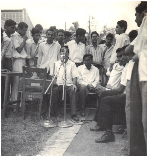
A Photo taken in 1966 during sports day

REC students were always on the top for sports and games especially our first batch students. It was really fun to watch