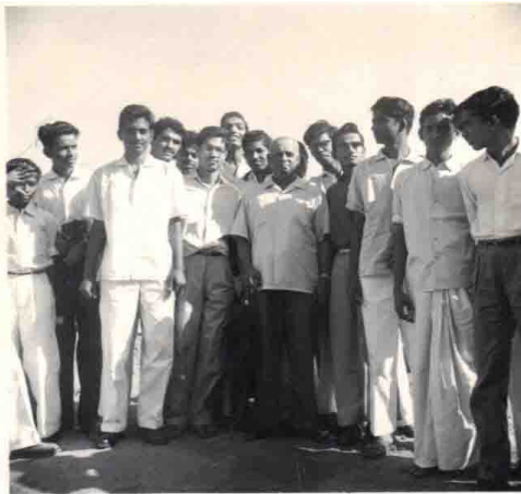
A Rare Click

from top to get its plan and similarly when projected them to a vertical plane from front to get elevation. Starting with a sharpened pencil he asked me to draw plan and elevation views of quite a number of assorted things available in the classrooms till I perfectly understood the concept well. Time flew. As I was deeply engrossed in rapt attention to his counseling and advices I lost all track of time and when the ses-